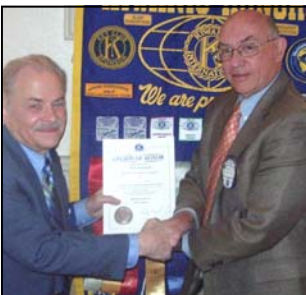
Editor’s red tie event