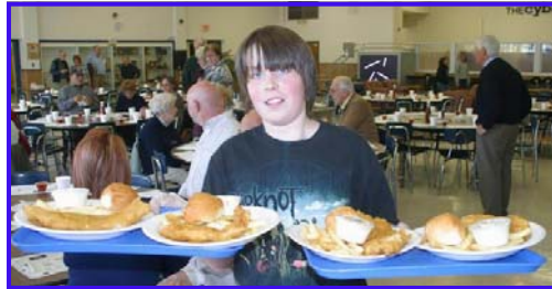
Our sponsored youth were great volunteers!