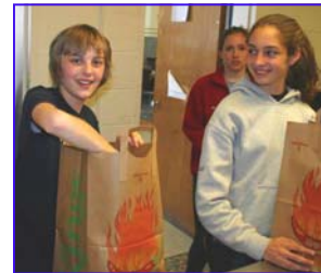
Hot food for customers