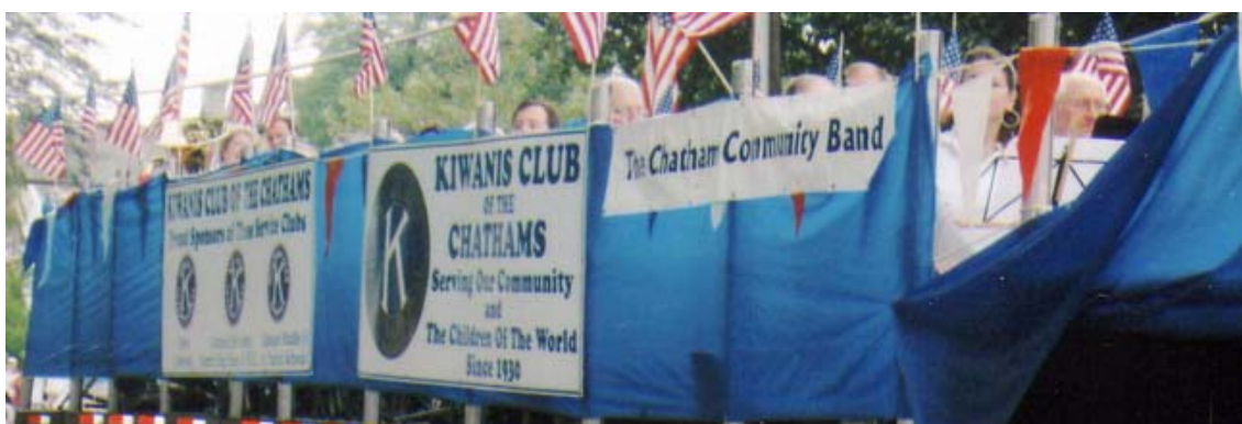
The Big Band Sound can be heard, and partially seen. The sound is great, and visibility will be improved next year. Banners announce the organizations we sponsor.