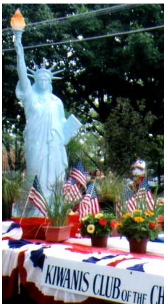
Kiwanis Parade Float

saw the decorations and preparation of the float used by the Chatham Community Band, an organization we sponsor. The Band float was donated by Coviello Brothers of 245 Main St. in Madison, and the Kiwanis float by Main Contractors of 143 Main St. in Chatham.