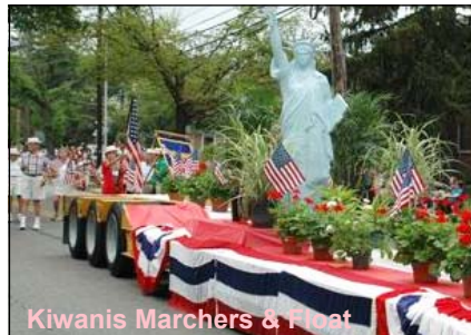
Kiwanis Marchers & Float