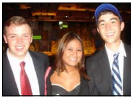
NJ District Officers