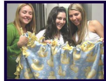
Circle K members pose with one of their five new blankets; this one with ducklings!