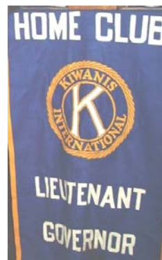
Lt. Gov. “Home Club”