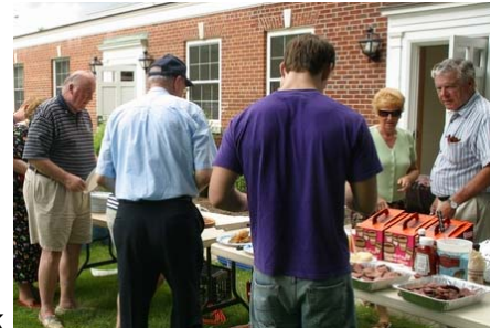
Steak, salads, and fruit pies, prepared by our Rotarian hosts.