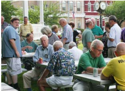
Good fellowship shared by members of the Kiwanis and Rotary Clubs.