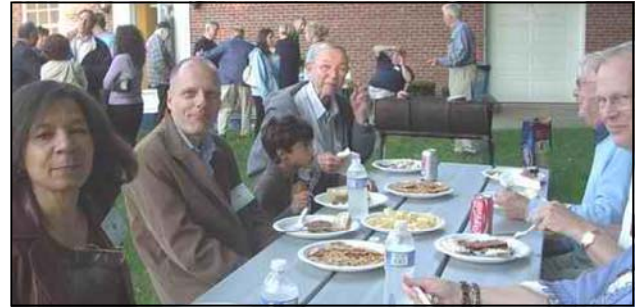
Kiwanians & Rotarians - together for annual picnic