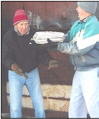
Newspapers from Erwin

I never attended any meetings with him but last July 4th, I visited Chatham because of the High School Reunion weekend. I was invited to walk in the July 4th Parade with the Kiwanis Club. While a lot of the "older" members rode on the float, Dad and I walked the whole parade route behind the float. He wore his Kiwanis shirt, pin and proudly had on the "straw" hat and waved