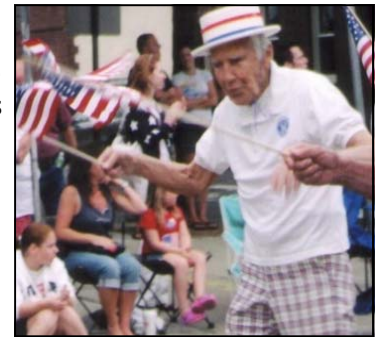
July 4th Parade and Flags

his flag. Dad was so patriotic throughout his whole life. It was an honor for me to walk in the parade with him and his fellow Kiwanians and was welcomed as an "honorary" member of the club for the day. After walking the whole route in the heat and humidity, he jumped right in and helped clean up the float.