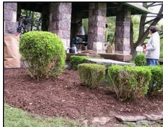
2009 Cole Park Cleanup—Before and After

raisers and community service projects Three of these events are scheduled in May, starting on the 1st. We will be part of "May Day in Madison", a town-wide beautification day, where volunteers improve many of the community's public places. Our focus will be on a spring cleanup of Cole Park on Greenwood Avenue. This attractive park, with its shrubs, stone pavilion and decorative tile fountain was "adopted" by the Madison Kiwanis,