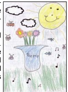
Service Bulletin Cover