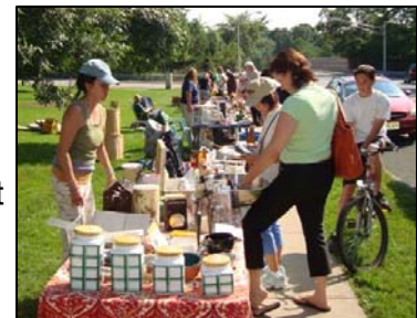
2009 Multi-family Garage Sale