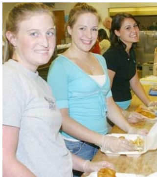
Drew Circle K Club Volnteers