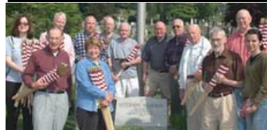
Last year's volunteers gathered around the veterans memorial flag.