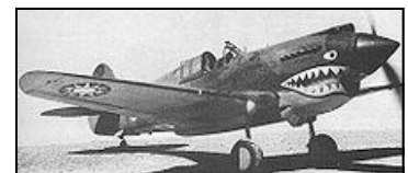
P-40B, "Flying Tiger"