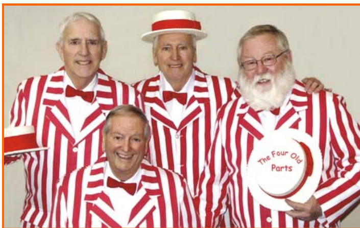
Left: Throughout the evening, we will be entertained by a colorful Barbershop Quartet, The Old Parts .