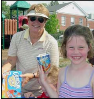
Marge hands out juices

Those boys and girls who read enough to earn 40 points were invited on August 14 to what