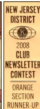
Ribbon award for our Crier