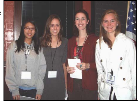
CHS Officers & Advisor: (L-R) Vice-Pres, Treasurer, Advisor & President.