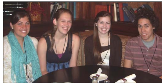
Madison High School Officers– Vice President, President, Secretary, and Treasurer.

At our May 25 breakfast meeting, we hosted a visit by